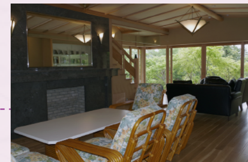
Kaede no Ma (Maple Room)

The ground floor was used as a study/reception room. There was a desk for meetings and an informal seating area.