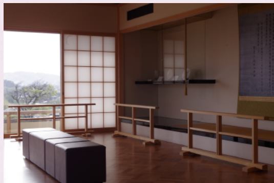
Kin no Ma (Golden Room)

The Silver Room was Shigeru Yoshida's private study and bedroom. He passed away peacefully in his sleep in this room.