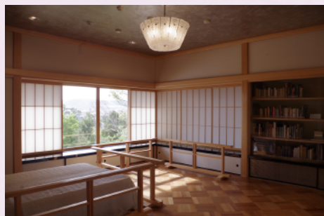
Gin no Ma (Silver Room)

The Silver Room was Shigeru Yoshida's private study and bedroom. He passed away peacefully in his sleep in this room.