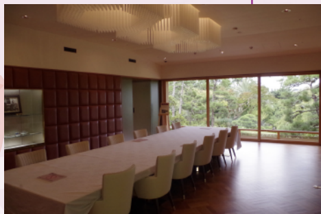
Dining Room (Rose Room)

The Golden Room was a reception room for honored guests. With the screen doors open, we can see the mountains of Hakone, Mount Fuji, and the Pacific Ocean.