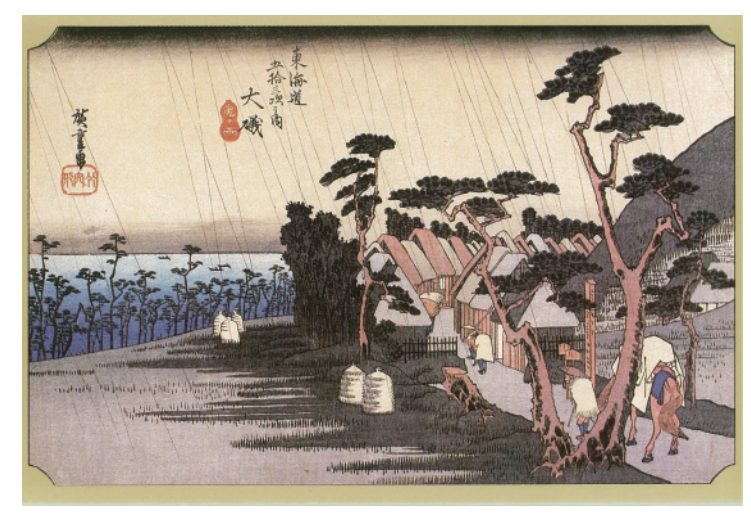
THE UKIYO-E